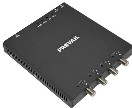
ONU Integrated 4*T1 Ports Master Device WLT-GP-M4J